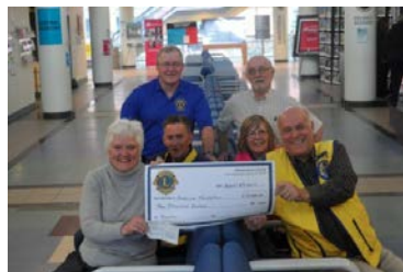
Hospice gets a boost from Valley Lion’s Clubs - $13,000!